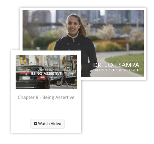
Watch the videos at bouncebackvideo.ca using the access code: bbtodayqc

The videos are available on our website at any time and for everyone; participants and non-participants alike. They are available in several languages: English, French, Mandarin, Cantonese, Punjabi, Arabic and Persian.